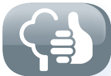
Environmental friendly (carbon neutral)